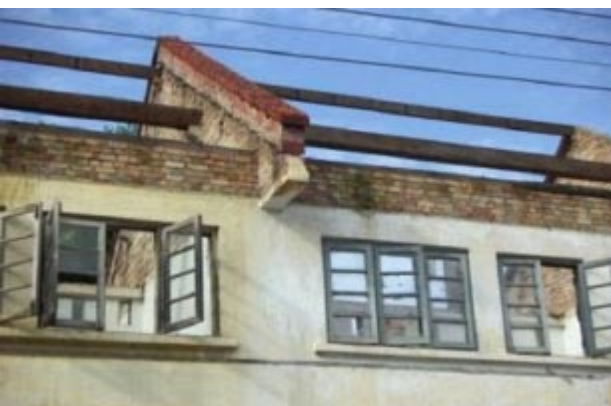
Second floor. Notice the red brick used for construction. They are still in good form.