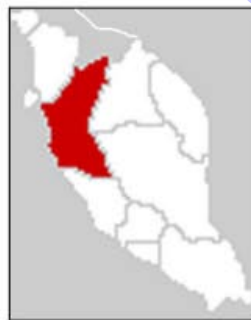
Location of the state of Perak in Peninsular Malaysia