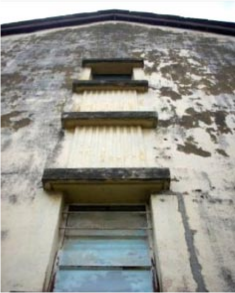
Traces of Art Deco features

Being the latest offering of an up-market housing area meant that Fair Park attracted mostly English tenants when it was first completed. In fact, if one were to flag down a rickshaw to go to Fair Park back then, one has only to mention “kee ah molau” – which means “go to the English houses” in Hokkien – for you to be promptly taken there. My mother still remembers that, when she was making her way home from her primary school those days, she would often stop by along the way to play around with the “Mat Salleh” (whites) kids.