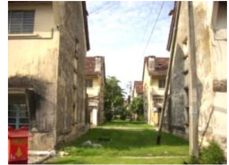
Passage between the blocks.

This need not have been the case. For if the authorities had been more sensitive to history, some research would have established the social and historical significance of Fair Park. Its architectural values could have been documented. The place could have been conserved. Even if that was not possible, at least the documentations would have been useful for future generations as a record of Ipoh history, as well as, homage to a piece of our heritage.