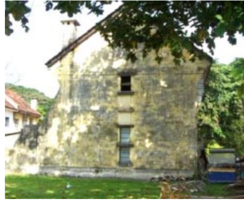
Side elevation of a block