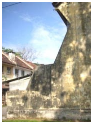
Unique profile of side wall.