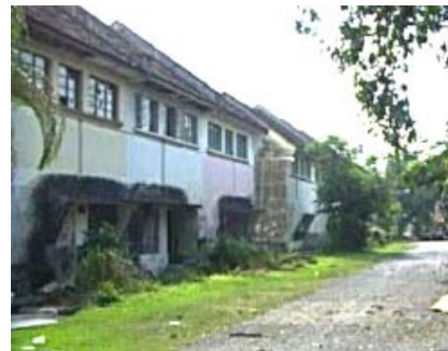
The road dividing two rows facing each other. A cosy and relaxing atmosphere. Just imagine this space teeming with life and activities back in its heydays.