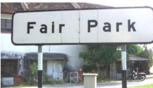
Signage on the main road, Jalan Kamaruddin Isa.