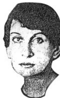
Sybil Kathigasu aged 37.